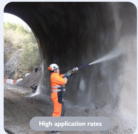
High application rates

Master Builders Solutions use of MasterRoc MSL 345 for faster application and production helped the customer achieve their goals. Reduced labour time, waste and curing speeds were observed. Plus, the ability to apply in complex geometries assisted with full coverage and lead to a long service life. 125 Tonnes of MasterRoc MSL 345 used.